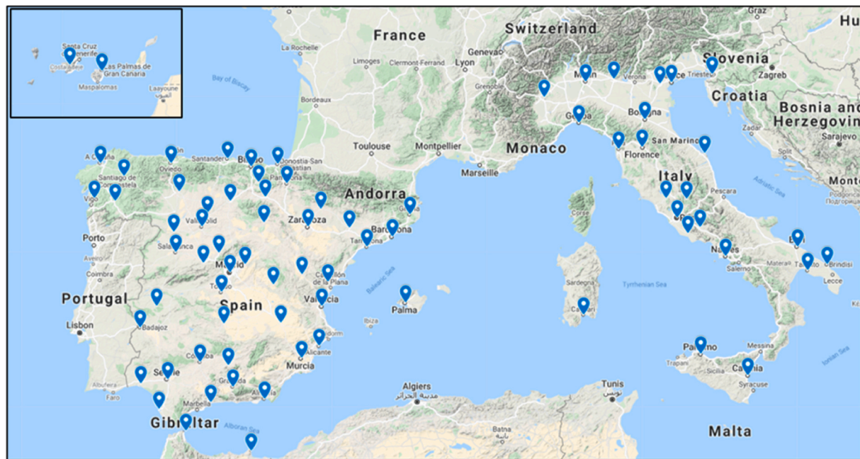
Fig. 1. 23 Italian and 52 Spanish included cities. The map shows all the cities included in the study. At the following link is possible to view the map with all the cities included in the analysis. https://www.google.com/maps/d/u/0/edit?mid=1vc7dEwj7i4IP-k1WeBhB-yPrDFyF2V9v&ll=41.40781805711539%2C-1.510221071452765&z=6